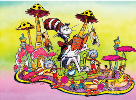
Kaiser Permanente’s Rose Parade float entry

For more information about KP’s Rose Parade float entry and related activities, visit us online at http://voices-wh .