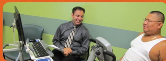
Pg 4—Get Moving, Keep Moving, Even at Office Visit