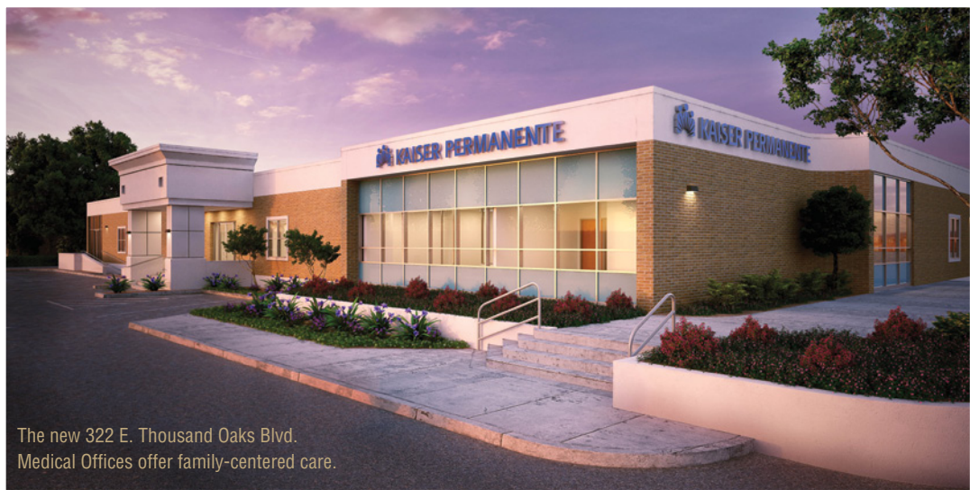
The new 322 E. Thousand Oaks Blvd. Medical Offices offer family-centered care.