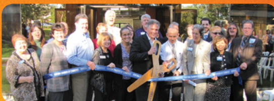
Pg 4—New Behavioral Health Center Opens in Ventura