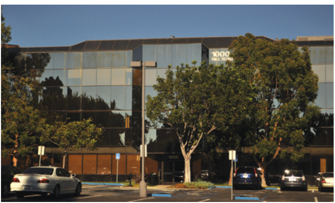
The new Behavioral Health Center enables us to provide high-quality care to our members in West Ventura.

The facility openings were preceded by ribbon-cutting ceremonies attended by local elected officials and community leaders as well as the Executive Medical