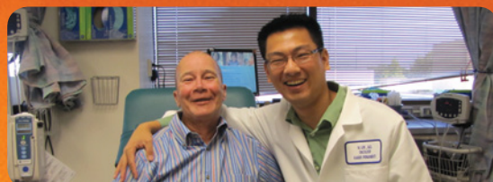
Pg 6—WH Patient Thanks his Care Team of 'Angels'