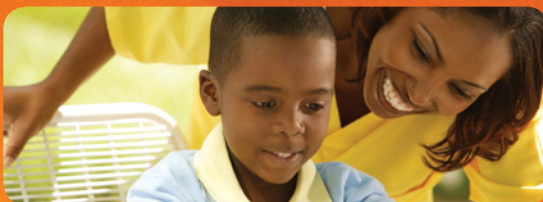
Pg 3—2013 Open Enrollment